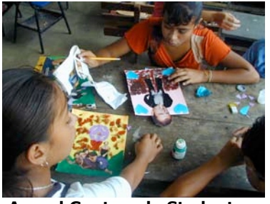
Arenal Guatemala Students produce their first collages

events. However, everyone enjoys the festivals so much that the nominated reporters often forget to make interviews!